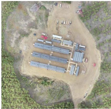
“RTEC 90-person camp”

“This will be the first time in the world that this technology will be used in an active project to reach a depth of 250 meters”