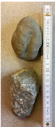
Trench Cutter fragments from the till (up to 80 millimetres)”