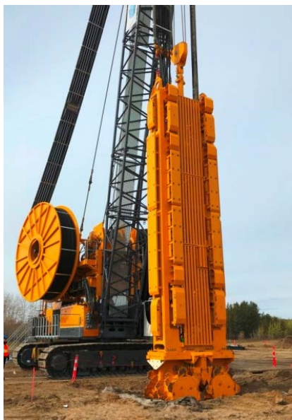
“Trench Cutter Sampling Rig”